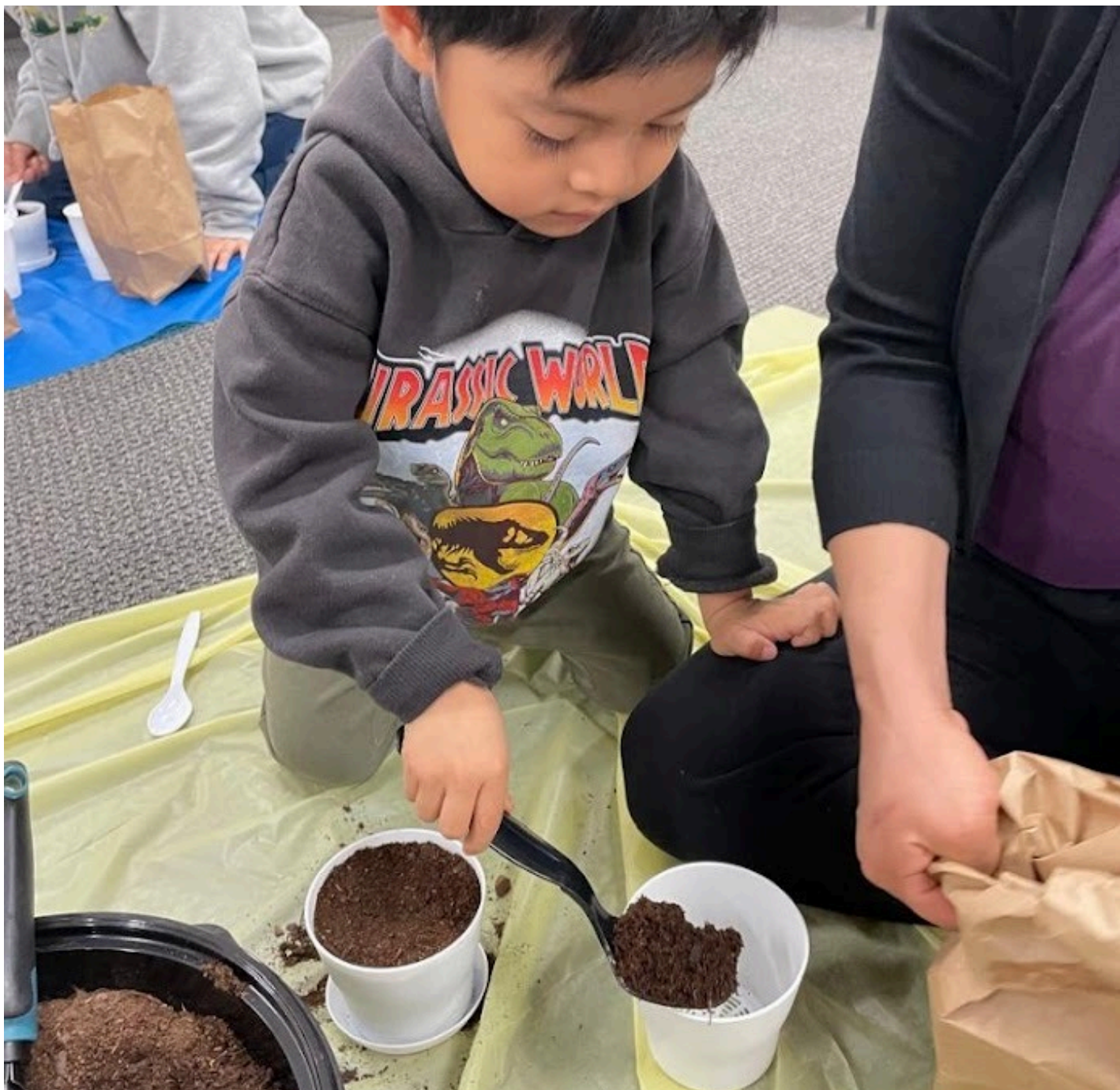
PROTECTING OUR PLANET EARTH