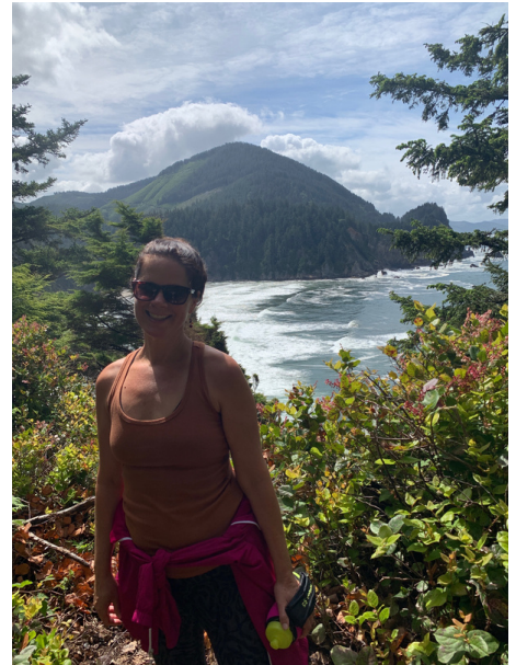
Hiking at the Oregon Coast, 2021