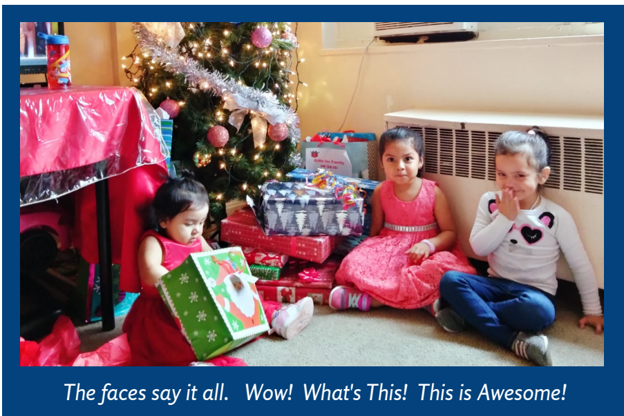
The faces say it all. Wow! What's This! This is Awesome!

The 2021 Holiday Helper program provided over 100 families with gifts donated from the community. Join us in 2022!