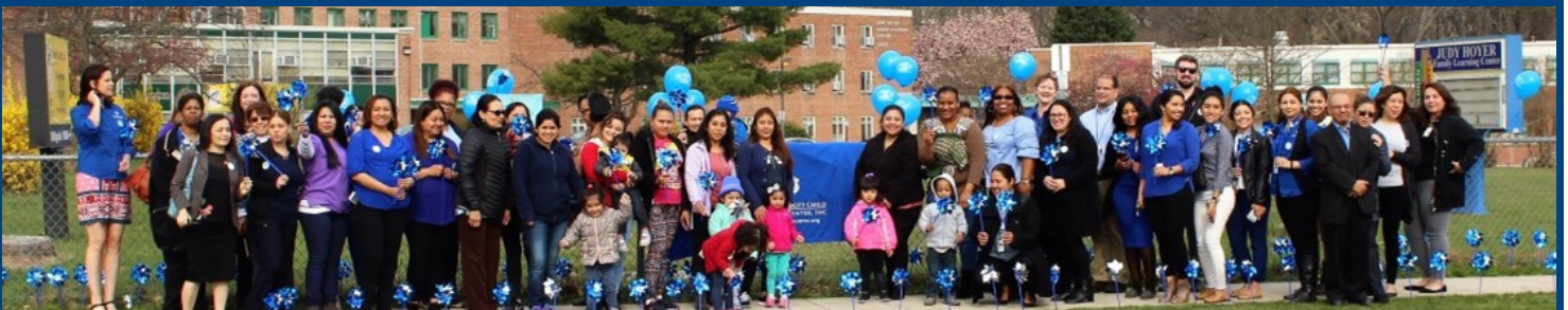
2018 Advisory Board shares child abuse prevention message with PGCRC staff and participants.

Our home visiting and family support programs value and seek community perspective. We cannot do our work without the support of people in the community like you. How can you help?