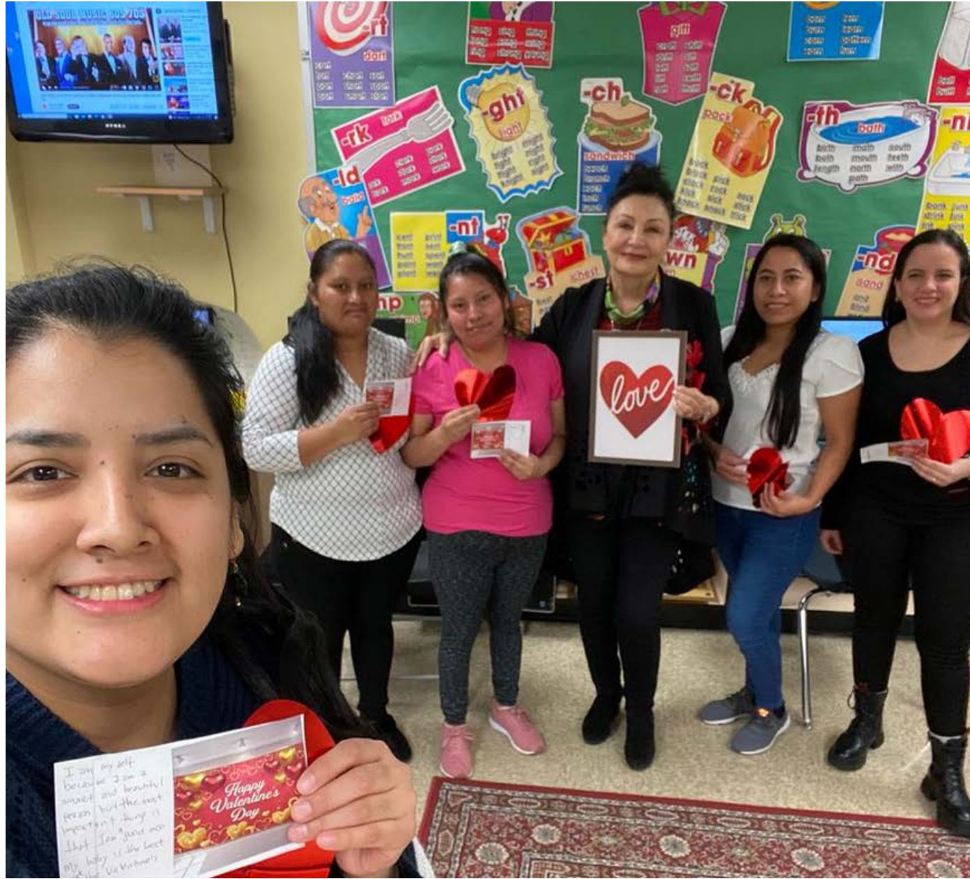
Unleashing the Power of Women!